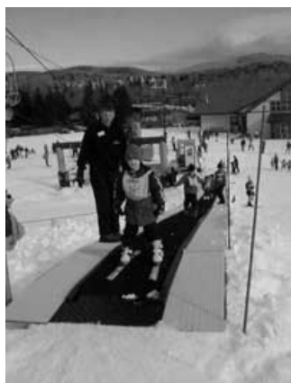
Figure Two. Measurement Guide for Conveyor Belt.

Distance from “load here” point to top of chair seat cushion