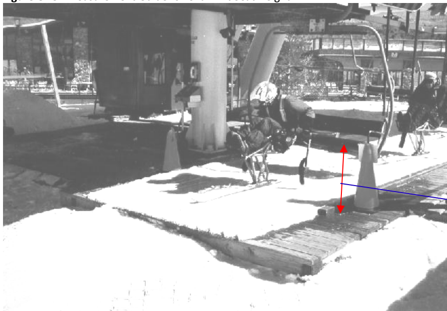
Figure One. Measurement Guide for Chair Lift Seat Height.

Distance from “load here” point to top of chair seat cushion